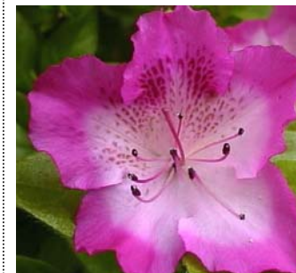
300 azalea varieties

Growers of Specialty Azaleas, Hosta & Daylilies