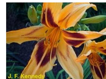
50 daylily varieties

Located 3 miles from Historic "Little" Washington, VA