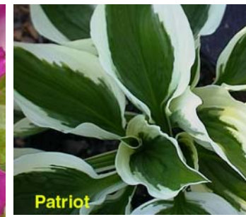
50 hosta varieties